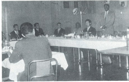
San Antonio Spokesman Club